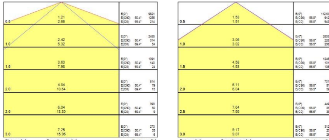
Distance [m] Cone diameter [m] Illuminance [lx] — C0 - C180 (half beam angle: 100.8°) — C90 - C270 (half beam angle: 44.4°)